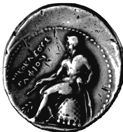
Fig. 1. Coin of Nikokles showing, on the obverse, Aphrodite with a crown of walls and turrets

indicate a historical connection between Agapenor, Paphos and Arcadia. Another possibility is that the story of Agapenor's foundation of Old Paphos, or part of it, was invented to explain the existence of the temple at Tegea.