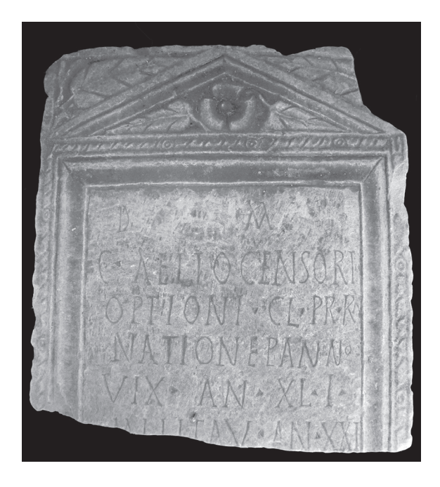
Fig. 3. Sepulchral inscription of Caerelleus Museus, miles in classis praetoria Antoniniana Misenatium IIII Venere from Salona

skirmishes that, unfortunately, we know nothing about. However, the literary sources described in some detail the Battle of Curicum in 49 BC and the Battle off the island of Tauris (not far from the island of Hvar) in 47 BC. Caesarean fleet was heavily defeated in the former, while in the latter it celebrated victory over Pompeian forces and regained control over the Adriatic.<sup>25</sup>