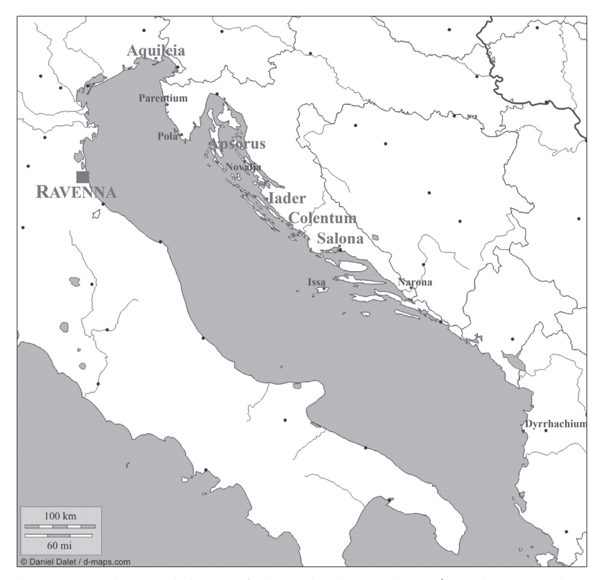
Fig. 1. Finding places of the inscriptions of sailors from the Roman imperial fleets at the Eastern Adriatic (red dots) (map by A. Kurilić 2012; cartographic base: http://d-maps.com/m/adriatique/adriatique15.gif downloaded on November 11th

logical excavations have unearthed remains of military camp just south of the colony of Forum Iulii; the camp existed several decades: it was built at the latest at the very turn of the eras (cca 10 BC - AD 15) and was definitely abandoned around the AD 70. A large bay has been presumed existing to its SW, which must have been capable accepting very large ships as were those captured from Marc Anthony.<sup>3</sup> While in existence, the naval base in Forum Iulii was in charge of guarding the coastal regions of Gaul, but it could have also served for transferring the land forces further inland.<sup>4</sup>