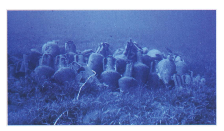
The Hellenistic wreck site lay less than a mile from Kyrenia harbor at a depth of ninety feet.