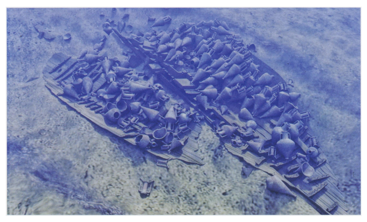
Computer imaging shows the two lowest layers of amphorae as they lay within the collapsed hull. Notice in this view from the bow how the ship has split apart along the keel. Over the keel on the port side some of the three rows of rectangular millstones are seen, with amphorae piled over them. Imaging such as this is a step towards visualizing how the ship fell apart after sinking.