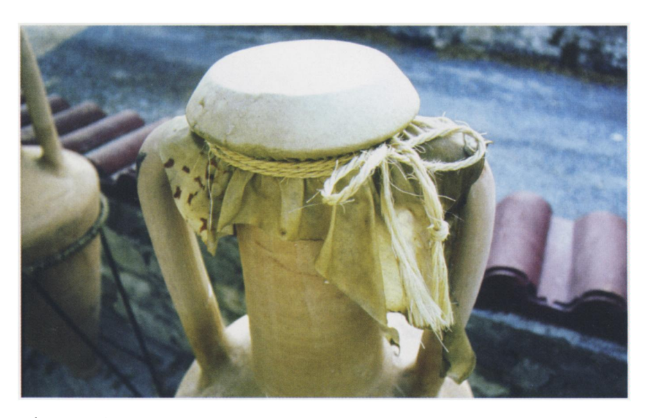
After several experiments to determine what material might have sealed the amphorae, we found goat skin to work. Tied on wet, the goat skin shrank tight as a drum as it dried.

I have touched on the first of our experiments aimed at learning some of the practical aspects of life on board. The final excavation report, when published, will include the results of these as well as additional innovative experiments, including finding surprising uses for wooden toggles at a sailmaker's in Maine, grinding grains with Kyrenia millstones, and sinking wine-filled amphorae stoppered with corks and skins to watch the seals implode. Our understanding of the excavated material will be all the richer for it as the old ship makes her final journey towards publication.