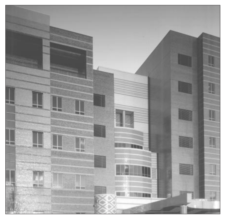
Architects Smith, Hinchman & Grylls used mortar cement mortar and brick of differing color and texture to define distinct building areas within a unified visual theme on the Veterans Administration Hospital in Detroit.

Availability: Mortar cements are regionally available in the United States and Canada from a network of dealers