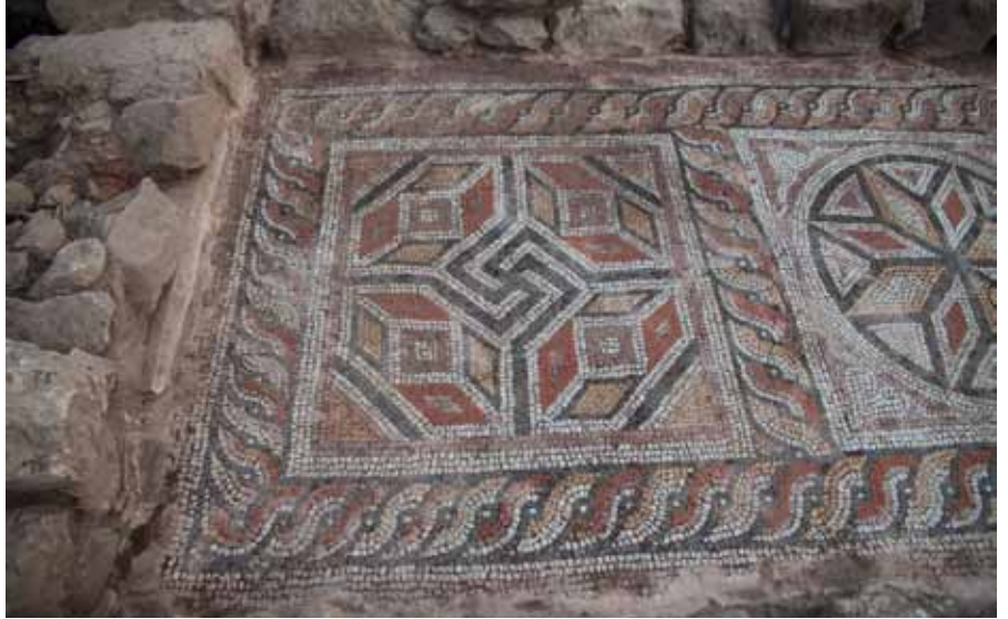
Figure 7 The second panel of portico mosaic.