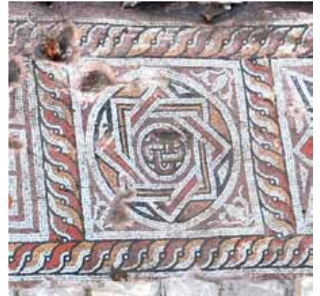
Figure 9 The fourth panel of portico mosaic.

Panel 6 has the centralized pattern of an interlooping square and curvilinear square (Décor II: 49) in a circle with an inscribed compound rosette of eight