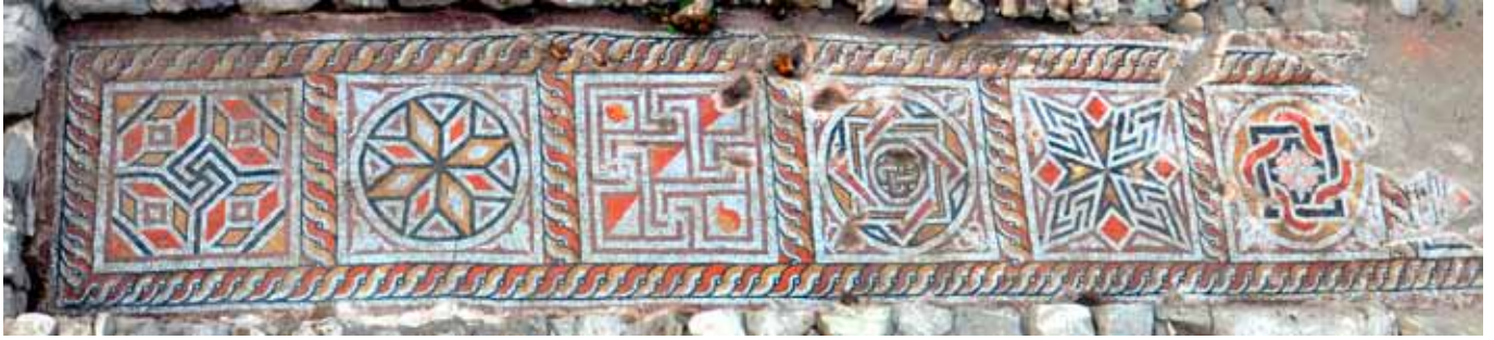
Figure 5 General view of the portico .