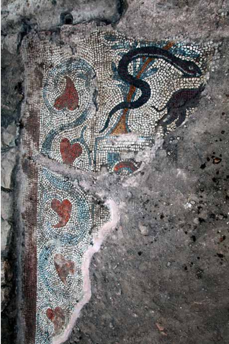
Figure 3 Detail of the border of triclinium mosaic.

times. A pink band surrounds the outmost part of the mosaic pavement and on the interior a simple blue ivy scroll with red hederae on white ground border the east, west and north sides. Although only a small part of the south frieze is preserved it is understood that this area consisted completely of a figurative space with various animal species (Fig. 3). Only a small part of the frieze is preserved on the east side with the depiction of a snake clinging to a plant and the rear body half of a feline. The tree is depicted in a simple way with blue, yellow and brown tesserae and has a short and thin trunk. The snake is s-shaped with a big head and a thin tail. Although it is depicted in front of the tree the real purpose must have been depicting it clinging to the tree. The outmost contour of the snake is black and the interior is made with black and dark brown tesserae. The slickness on the body was emphasized with a line of white tesserae on the underside of the body extending from the mouth to the middle of the body. The eye is formed