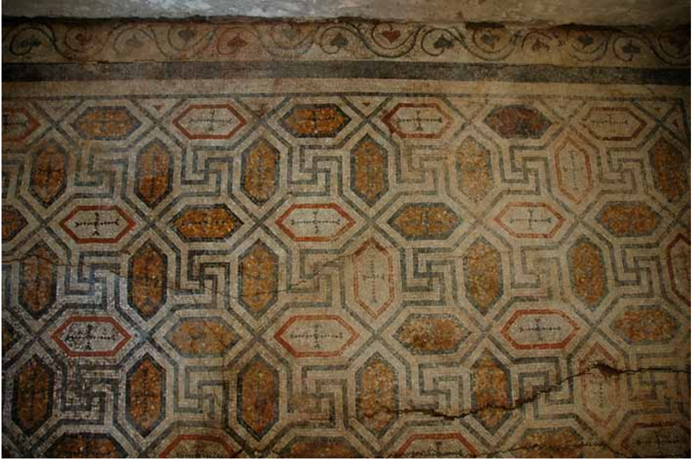
Figure 12 Detail of apodyterium mosaic of Yamaç Ev also in Antandros.

Although the ivy scroll bordering the triclinium mosaic has no equivalent in style, a border pattern of ivy scrolls is frequently used on mosaic panels with geometric patterns in Aphrodisias. An ivy scroll in the panel of the mosaic on the south room of the tetrapylon house in Aphrodisias this time is not placed on the border (Campbell 1991: pl. 59-60). In this example a lioness and a snake placed opposed to each other (in attack position) are depicted between an ivy scroll arrangement. This panel may consist an example for the elements that were used together (the ivy scroll and a snake with an animal on the south edge) in the border layout in Antandros.