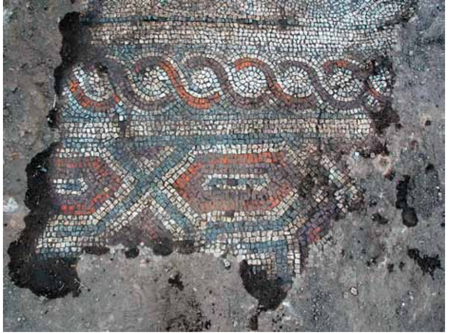
Figure 4 Detail of the inner border and main panel decoration of triclinium mosaic.

with white tesserae and black tesserae were used for the pupil. The head of the snake approaches the other animal figure which moves with its back facing the tree. The rear body and hind legs of this animal are preserved. It is depicted in a walking position marching forward. It has a thin tail with an uplifted tip. Its contours are black and its body is dark brown. The figures are positioned in the frieze in a direction that enables them to be seen by the observers in the room.