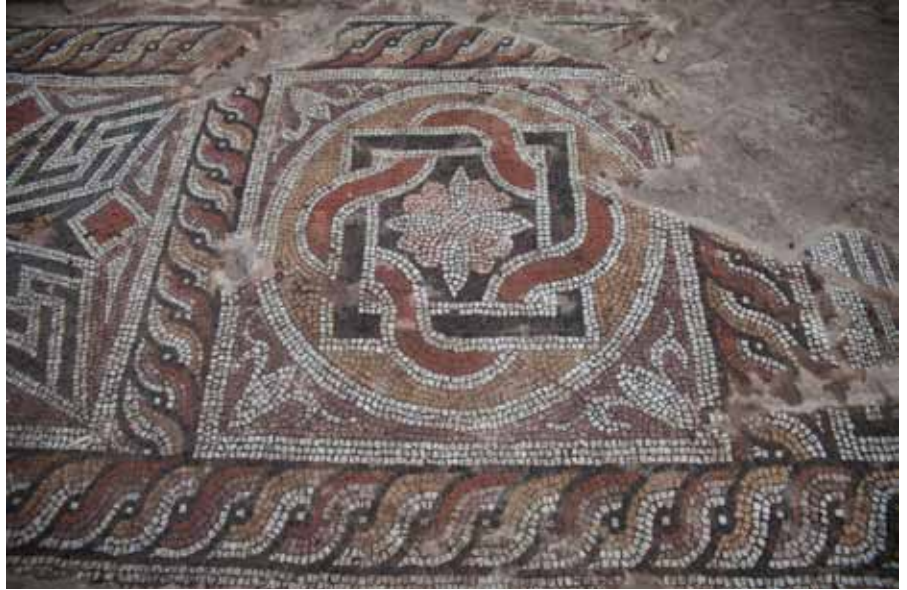
Figure 11 The sixth panel of portico mosaic.

adjacent elements, four as inward-pointing hederae and four as spindle-shaped petals (Var. of Décor II: 66 pl. 267a.). In the center of the rosette, contrary to common use, there is no circle overlapping the petals. The spandrel-shaped spaces on the corners of the white square border are decorated with a floral motif resembling a spindle-shaped petal with volutes (Fig. 11).