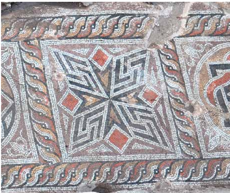
Figure 10 The fifth panel of portico mosaic.