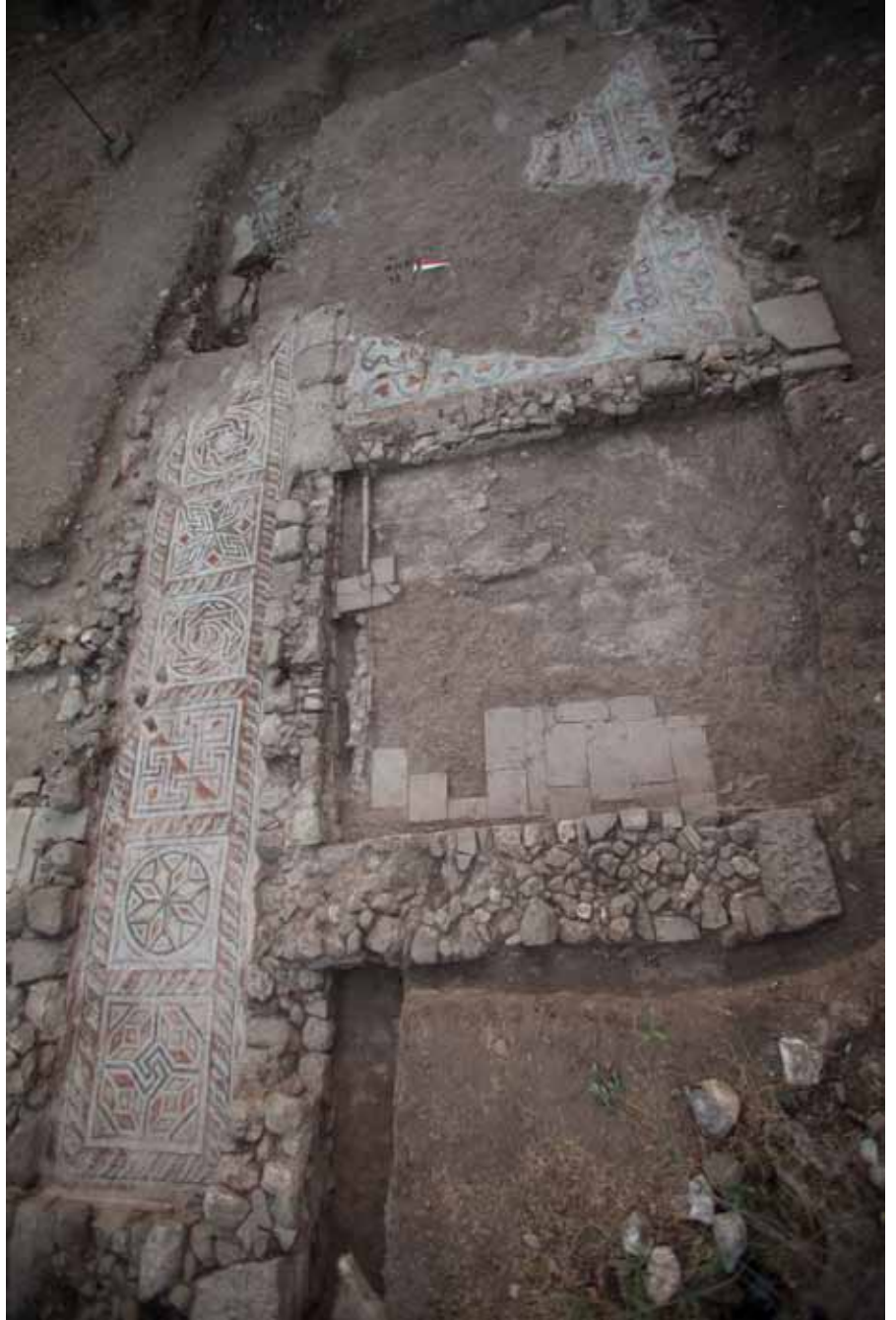
Figure 2 General view of Roman House.

The preserved part of the corridor mosaic consists of 6 separate geometric panels surrounded by a guilloche. Three spaces opening to the corridor were located on the north.