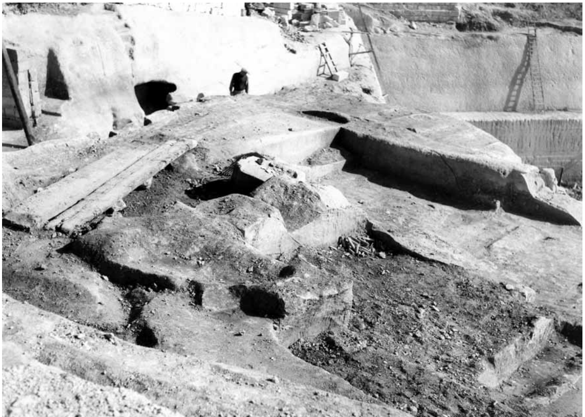
Plate 1. Possibly the same burial complex depicted in Figure 1 which was 'rediscovered' during civil works which were being carried out in the area

parts of a tomb still visible in a section of rock on the side of the road leading to the power station form part of this same complex. The same uncertainty surrounds another discovery, this time datable to the 1960s when part of a catacomb complex was uncovered during works near the power station (Plate 1). In 1888, Caruana describes very interesting discoveries in the Kortin area. These include burials within dolia, placed lip to lip, with a body inside (Fig 2). In itself this discovery is very important. Dolia are usually used as storage jars, buried up to their rim within warehouses. Here it seems that these had been dug up and reused for burials. Caruana states that many of these dolia burials were discovered in the area of the gasworks that were being developed in the area.