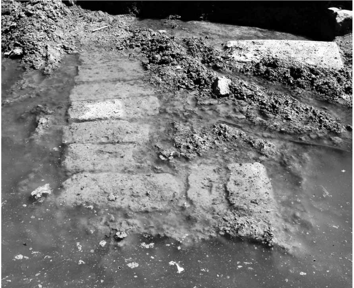
Plate 2. Architectural features related to the Roman port complex which were uncovered in 2005

in 2005 it was evident that the archaeological deposits are not only substantial but also, due to the anaerobic conditions of the sediments, very well preserved. Such a site deserves further attention that would involve various stakeholders contributing to a long-term project aimed at achieving a better understanding of Malta's Roman past.