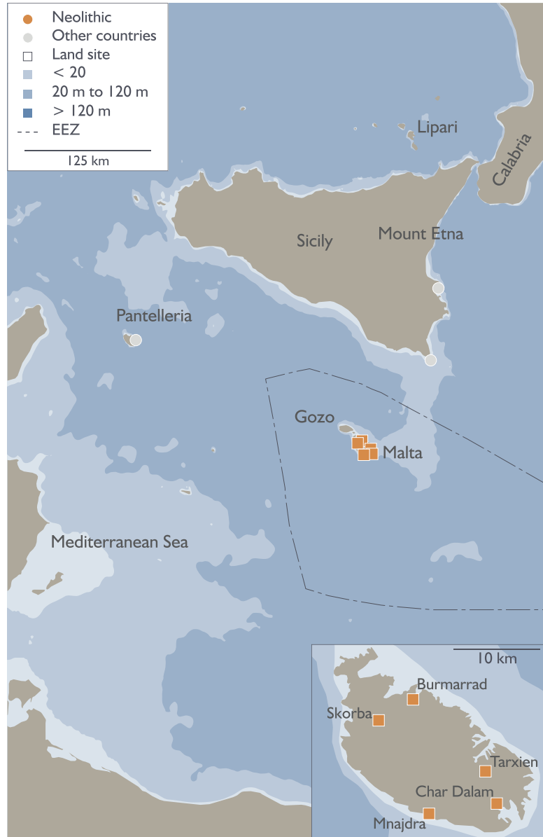
Fig. 17.1 Sites and geographical areas mentioned in the text. The 120 m depth contour is roughly equivalent to the coastline when sea level was at its lowest at the Last Glacial Maximum, while the 20 m contour represents a time somewhat prior to the currently known earliest traces of human activity on Malta. Drawing by Moritz Mennenga

ture that is best known for its spectacular ‘temples’ built of large worked and decorated stones (Evans 1971; Pace 1996; Ugolini 2012) (Fig. 17.2). At least 26 such megalithic monuments have been discovered, and UNESCO has declared the surviving structures as a World Heritage Site. Many of them are located in prominent positions that overlook natural harbours and have commanding views over the sea. Since the sea level of that period was approximately the