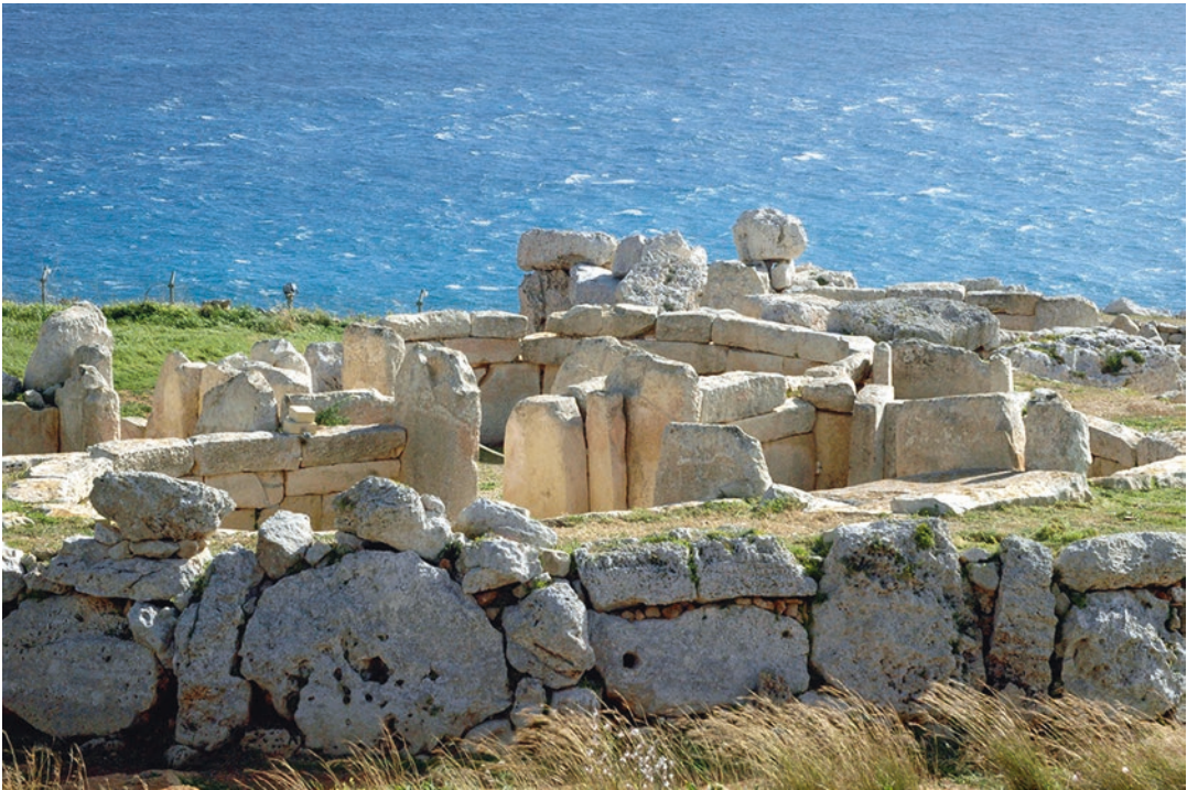
Fig. 17.2 The Mnajdra Temples built close to the cliff edge looking towards the sea. Photo by Alecstorina93 , made available under Creative Commons License Attribution-ShareAlike 3.0 Unported (CC BY-SA 3.0). https://creativecommons.org/licenses/by-sa/3.0/deed.en

materials, for instance, obsidian from both Lipari and Pantelleria, at distances of 159 km and 204 km, respectively (see also Castagnino Berlinghieri et al., this volume). Imports of red ochre, flint and pumice are also represented in the archaeological record of this time. Likewise, miniature axes found in Malta are made from various rocks originating from Calabria in the southern Italian mainland and from Mount Etna on Sicily (Trump 2002, p. 38–41). The presence of a few ‘exotic’ ceramic sherds confirms trade in finished goods originating from Sicily (Trump 2002, p. 211).