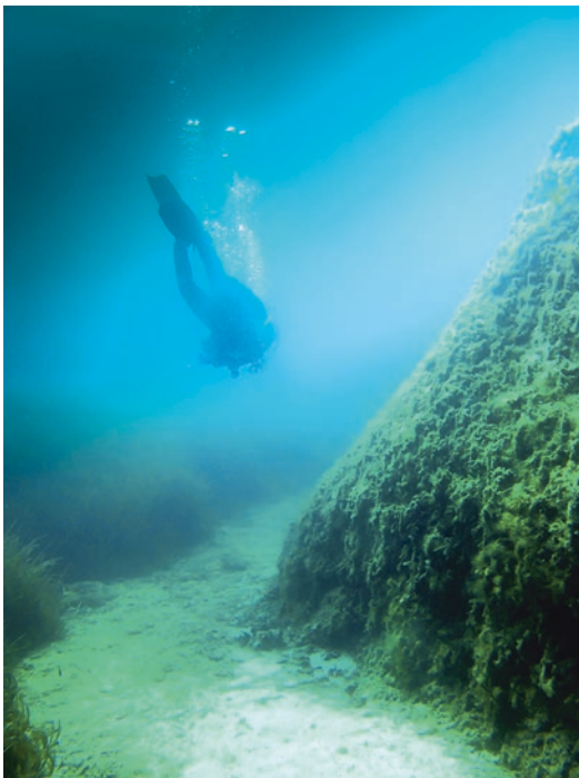
Fig. 17.4 Posidonia oceanica vegetation in different stages of development. The thick mass of vegetation to the right, known as a matte, is approximately 6 m in height, concealing any archaeological material that may be present on the seabed.

Malta has a long tradition of underwater archaeology focused on more recent millennia, primarily remains of ancient shipwrecks as well as other remains datable to the historical period (Azzopardi and Gambin 2012). Systematic searches for submerged Stone Age sites have not yet been attempted. However, the reconstructed topography of the submerged coastal zone during this period shows plains and rivers that may have been conducive to human settlement (Fig. 17.3). Today, these areas are covered by thick marine sediments as well as by dense mattes of Posidonia oceanica (Fig. 17.4). This cover of Posidonia