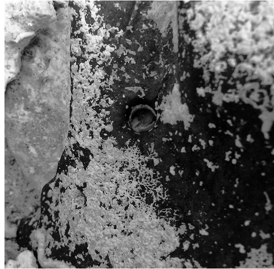
FIG. 6. The hole in the neck of an amphora found in a shipwreck in the Eliza Shoals.

While Butcher and Opait note that in general wine amphoras were often designed with a long neck to accommodate the expanding gases produced by continuing fermentation, 69 many of those in Egypt from various periods have a small hole in the neck. 70 The practice is illustrated in a mural of the wine-making process in the 18th Dynasty tomb of Khaemweset. 71 James sees evidence even earlier in Old Kingdom wine making: 72