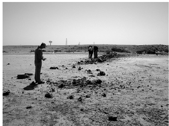
FIG. 2. Two views of the jetty at Khor al-Kharrar: top , the jetty, looking north into the lagoon, from the high ground near the middens and fireplaces; bottom , the jetty from the edge of the lagoon (the rise in the background on the right is the high ground where the middens and fireplaces are located).

lagoon can reach 8 m. 48 The true interface between land and water is difficult to discern, as its location is variable based on wind and water conditions. The jetty is nevertheless now unserviceable, as it cannot be reached by boat, nor can the structure be used for fishing. Thus, the jetty must have been constructed in a period of deeper water conditions along the southern edge of the lagoon. Sediment studies show that deposits in the southern sections of the lagoon are finer than those in the north and are due to flash flooding in the rainy season, but the rate of deposition is not known. 49 There were no artifacts associated with the jetty, which would have aided in the dating of the