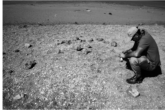
FIG. 3. A midden of mollusk shells on the rise behind the jetty at Khor al-Kharrar, with a low semicircle of coral pieces on its western edge (J. Wangen).

Al-Shoaiba was the harbor for Mecca in pre-Islamic and Early Islamic times until Jeddah rose to prominence. 50 Although it appears to have had no formal development, al-Shoaiba “accommodated some kind of ship-berthing and loading/off-loading activity . . . [as] one of the very few places along the western Arabian coast which could have accommodated such activity.” 51 It served to bring foreign goods to Mecca, which was only 85 km away, and to send Mecca-area products, such as leather and horn-based goods, into the maritime network linking Mecca to the southern Red Sea cultures, such as the Aksumite kingdom. 52 Indeed, al-Shoaiba was the place from which the early Muslims fleeing persecution sailed for refuge in the