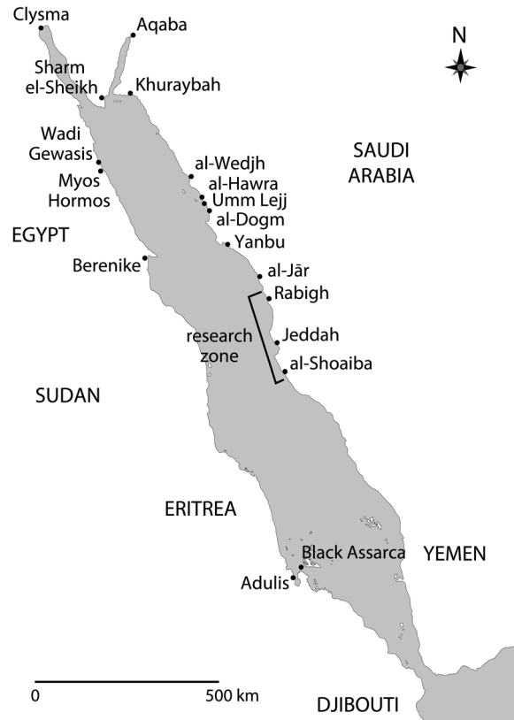
FIG. 1. A map of the Red Sea, showing key sites mentioned in the text.

Farther south are a series of harbors that were surveyed in the late 1970s or early 1980s. 13 These contained artifacts of Nabataean and Islamic origin along with such features as coral-block foundations. 14 These harbors include al-Hawra , which Burton equates with Leuke Kome and at which some archaeological trenches were dug in the early 1980s; 15 Bar Antar , located on a small inlet north of al-Wedjh and containing many artifacts and coral-built buildings; and al-Sawrah , located between Bar Antar and Khuraybah and containing