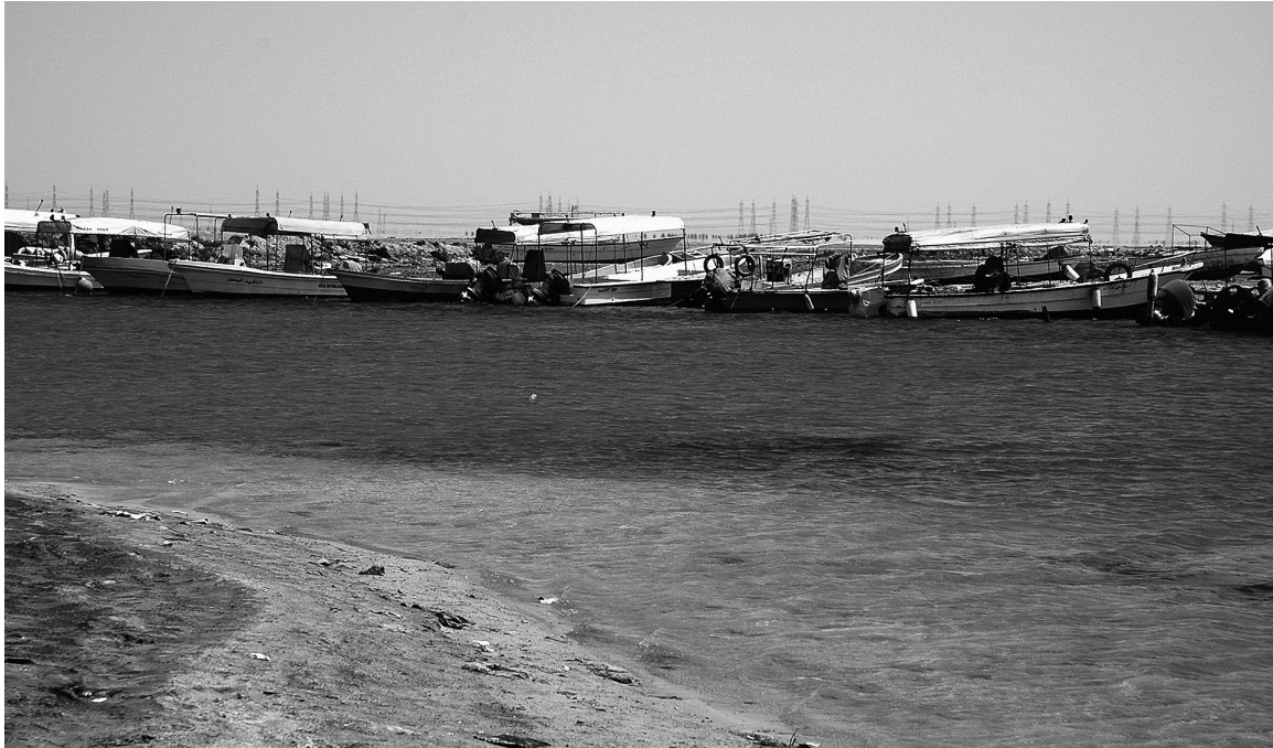
FIG. 4. The modern harbor at al-Shoaiba, southern inlet (W. Held).

survey along each inlet at al-Shoaiba revealed no ancient detritus, such as the broken pottery expected in a harbor site, or signs of ancient use. However, the southern sides of each inlet were not examined, as they were inaccessible. The mangrove stands within the lagoon and their exploitation for wood were likely determining factors in the selection of places such as al-Shoaiba. 59 Thus, if watercraft accessed the lagoon, they would likely have stayed in the vicinity of the inlets and accessed the mangrove wood via small boats. 60