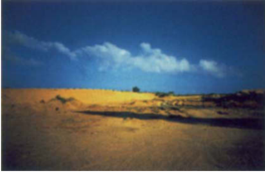
FIGURE 1 (above). View of el-Moghraqa, facing south.