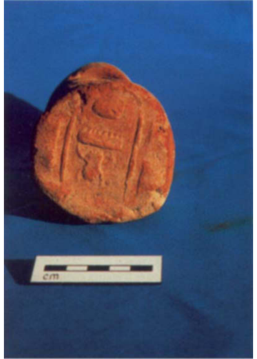
FIGURE 2 (right). Cone fragment with penguinon of Thutmose III.