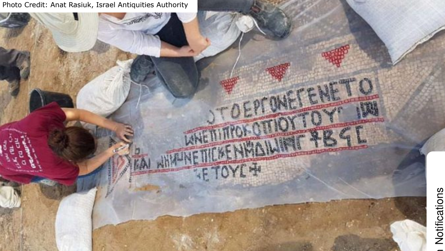
Tracing the mosaic's writing.

By JNi.Media - 6 Kislev 5778 - November 23, 2017