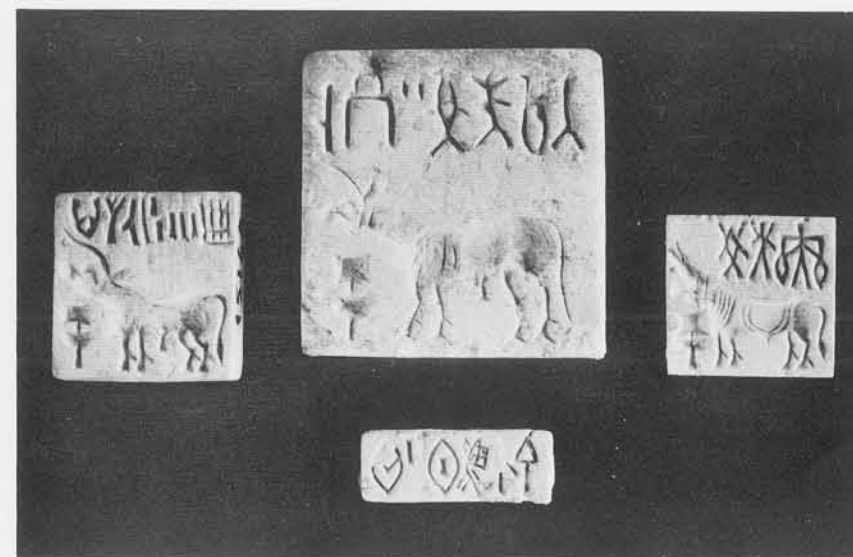
Seals excavated at Lothal, with the same script as at Mohenjo-daro

There is, however, one possible source of significant information about the Indus civilization which is still untapped: the inscriptions of Sumer, approximately six hundred miles to the west of the mouth of the Indus and separated from the Indus land by the Arabian Sea and the Persian Gulf. That there was considerable commercial trade between the two countries is proved beyond reasonable doubt by some thirty Indus seals which have actually been excavated in Sumer—and no doubt hundreds more are still