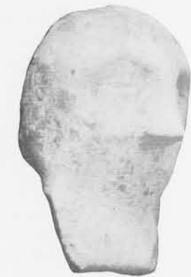
Mesopotamian-like bearded terracotta head excavated at Lothal

That place is clean, that place is most bright; Who had lain by himself in Dilmun— That place, after Enki had lain with Ninsikilla, That place is clean, that place is most bright. In Dilmun the raven utters no cry, The wild hen utters not the cry of the wild hen, The lion kills not, The wolf snatches not the lamb, Unknown is the kid-devouring wild dog, Unknown is the grain-devouring boar, The malt which the widow spreads on the roof— The birds of heaven do not eat up that malt, The dove droops not the head, The sick-eyed says not “I am sick-eyed,” The “sick-headed” says not “I am sick-headed,” Its old woman says not “I am an old woman,” Its old man says not “I am an old man,” Unwashed is the maid, no water is poured in the city, Who crosses the river (of the Nether World) utters no groan (?), The wailing priest walks not round about him, The singer utters no wail, By the side of the city he utters no lament.