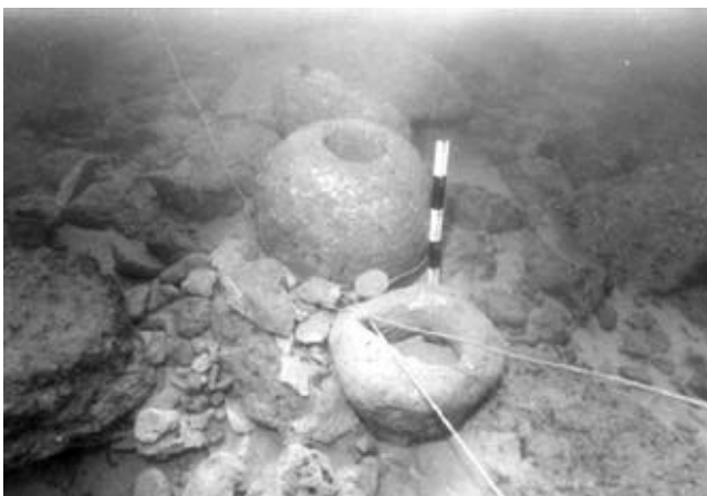
Figure 7. Ringstone anchors.

few ring-stones also have the evidence of chisel marks on their surface, around the hole and on the flat bottom side.