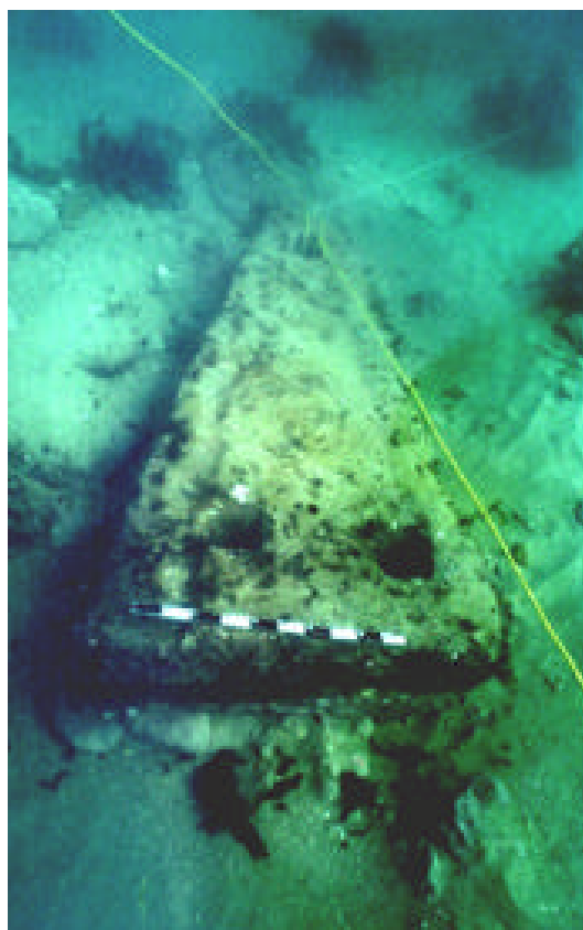
Figure 5. One of the biggest composite stone anchors.

(ii) Grapple type: Several grapple-type of stone anchors were also found in the Dwarka waters. During our exploration we retrieved 63 of such anchors. Most of them are made of locally available limestone and a few are made of basalt rock. Often they have been cut from a long solid prismatic block (Figure 6). The anchor has an upper hole and two lower holes cut in square or rectangular shape.