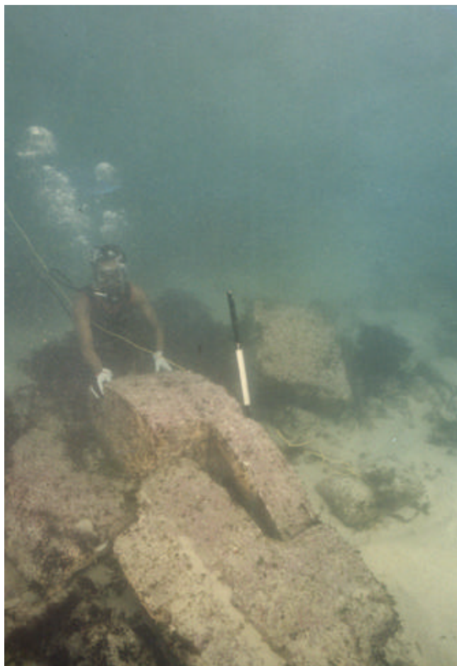
Figure 3. Stone blocks with L-shape cut.

structures are lying exposed on the rocky sea-bed, however, a few of them are partially buried in the sand. The exposed portions of the structures are covered with thick vegetation. A rectangular stone block bearing an inscription in the Gujarati script is another important find worth mention here.