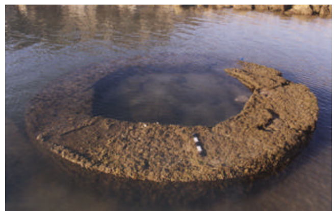
Figure 2. A circular stone structure exposed during low tide off Dwarka.