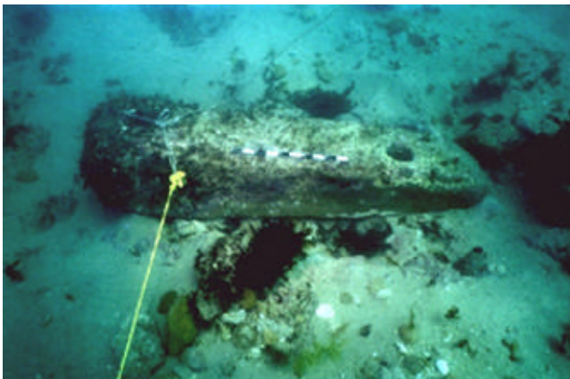
Figure 6. Grapnel or Indo-Arab type anchor.

(iii) Ring-stone type : Ring-stone type anchors are also found in the Dwarka waters. Twenty-five anchors of this type were found and these lie scattered from inter-tidal zone to 16 m water depth. An important characteristic of the ring-stone anchor is its circular shape, with an axial hole (Figure 7). Often, the base of ring-stone is flat and top is semi-circular rising to a certain height. Most of the ring-stone anchors remain exposed on the seabed; however, a few are partially buried in the sediments. Up to a depth of 8 m, the exposed portion of the ring-stones is covered with marine growth such as seaweeds. Beyond this depth they are covered with a thin layer of greyish marine growth. They are normally found lying in vertical position, tilted and flat positions are not uncommon. A