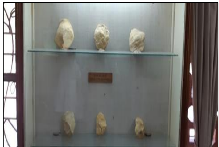
Fig. 6: Artifacts and ornaments at museum