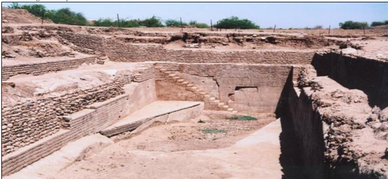
Fig. 4: Reservoir

One of the unique features of Dholavira archeological site is the sophisticated water conservation system. The city had massive reservoirs, among them three are exposed. Which is earliest found anywhere in the world. Within the city there were a series of well-planned rectangular water reservoirs, which was meant to harness the scarcely available water in the region. The inhabitants of Dholavira created 16 reservoirs of varying size. Some of them have taken advantage of slope of the ground.