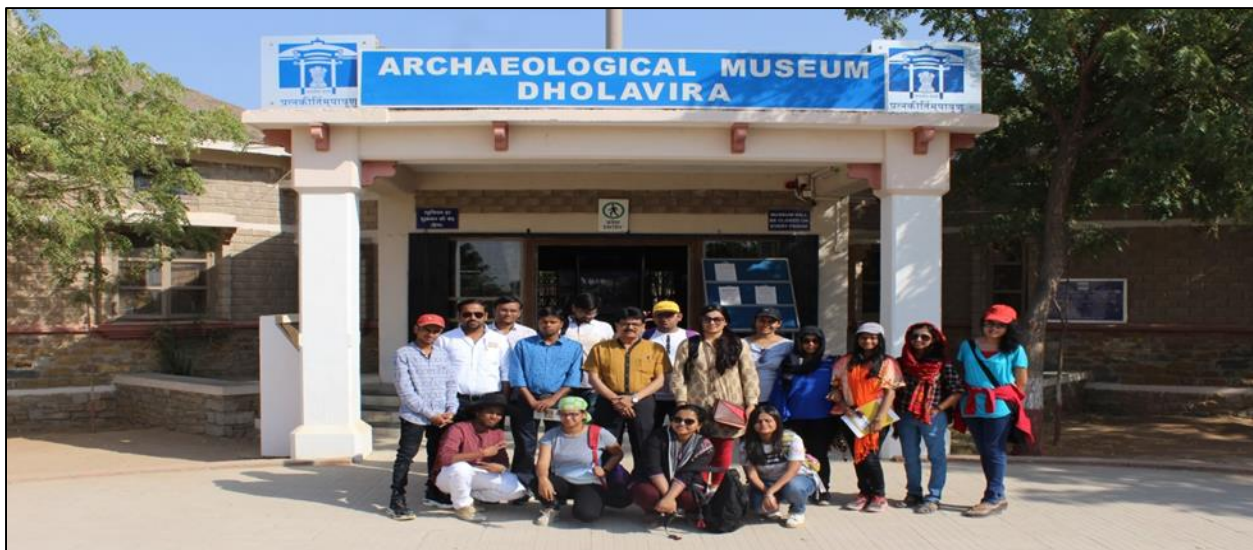
Fig. 7: Archaeological museum of Dholavira