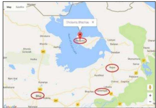
Fig. 2: Map of Khadir Bet

Nearest major stations near Dholavira are Bhachau, Samakhya, Bhuj and Anjar. Their distance from the Dholavira is 66 km, 70km, 88km, 86km. as consequent.