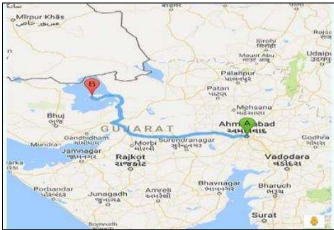
Fig. 1: Map of Bhuj