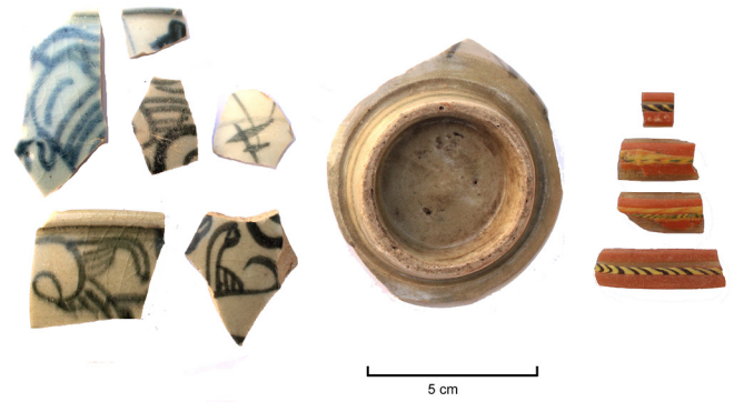
Figure 6: Nineteenth century archaeological materials from Bulhar. Left: Chinese porcelain. Middle: late celadon. Right: glass bangles.

To identify possible older occupations a smaller trench of 1 x 1.5 meters was opened to the west of the test pit, where the floor had mostly disappeared. The removal of the floor and of an underlying layer of sand showed a complex series of alternate, horizontal layers of sand and ashes, usually no more than one centimetre thick. These layers were perforated by three postholes, two of them circular (10 and 12 cm of diameter) and one rectangular (20 x 15 cm) and filled with ashes. They defined a hut, the interior partially exposed in the excavated area, supporting the existence of a stable occupation in Bulhar before the late 19 th century. The excavation of the rest of the test pit down to this level recorded several layers of ashes and charcoals, probably corresponding to episodes of generalized destruction, either by violence or accidental fire. This floor yielded a large amount of faunal remains, most of them consisting of very specific parts of sheep/goat—especially ribs. Few other materials were present and were very fragmented, not allowing for precise dating beyond a generic assessment of a 19 th century date. Due to time constraints the excavation could not continue. However,