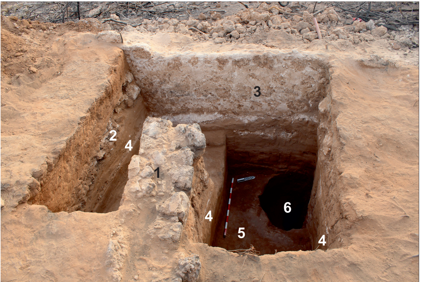
Figure 4: Test Pit 2. 1 British low wall; 2 Collapse layer corresponding to the late nineteenth century wall; 3 Late nineteenth century wall; 4 Floor of the courtyard; 5 Older layer of the excavation; 6 Nineteenth century refusal pit.

however, construction techniques and materials are identical to those in the centre of the city and therefore should be considered contemporaneous. Only two buildings were identified with all certainty as belonging to the Egyptian period: the lighthouse to the west of the town, and a fortlet to the east. Some houses, however, were probably built before the British occupation. This is suggested by the existence of several additions and reconstructions, sometimes using different materials, which are obvious in the fabric of several structures.