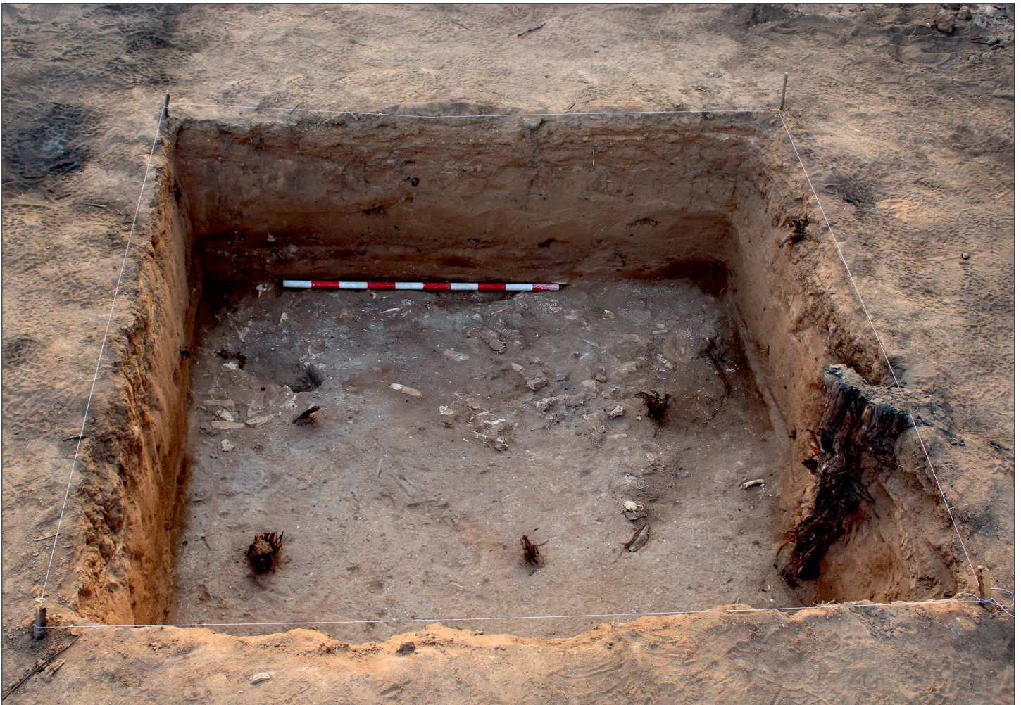
Figure 3: View of the bones scattering of Test Pit 1.