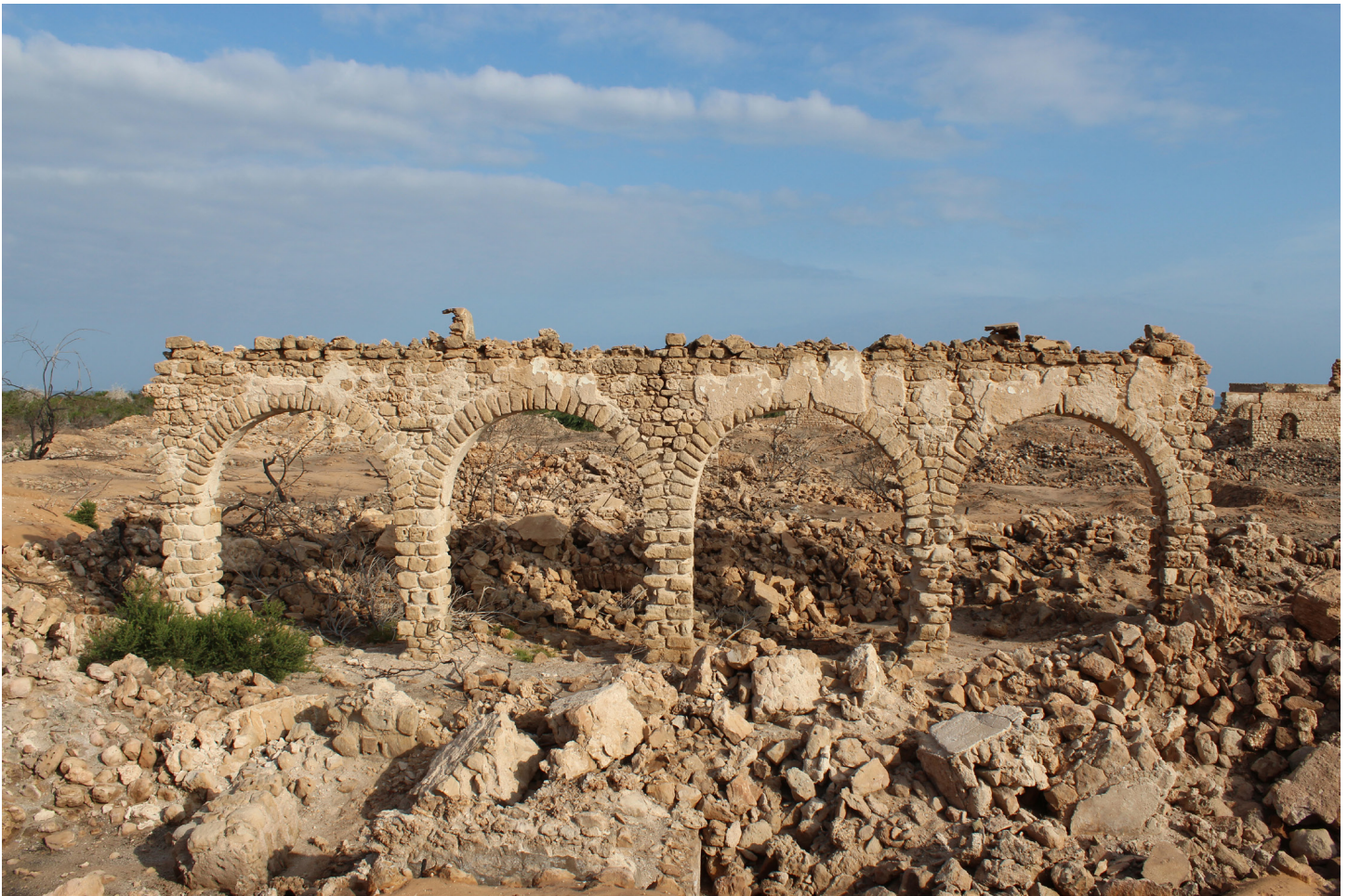
Figure 2: Series of arches in one of the houses of the centre of the city.

bursi clan had occupied Bulhar “300 years ago” (that is, mid-16 th century). In 1855, Bulhar was occupied only seasonally (Burton 1894 [2]: 67), but only fifteen years later Bulhar and Berbera were occupied by the Egyptians (Turton 1970: 358) and were described by a German as “the greatest marketplace of the country” (Haggenmacher 1876: 36), a status maintained during the last decade of the 19 th century (Nurse 1891: 663; Pankhurst 1965). The most accurate description of the town comes from Ralph E. Drake-Brockman, who visited Bulhar at the beginning of the 20 th century and provided information about the origins of the city and the only known photographs preserved so far. According Drake-Brockman (1912: 40), the city was founded just fifty years before (that is, around 1850), coinciding with Burton’s date of 1847 (1894 [1]: 79). The origin of the town was a feud between the Rer Ahmed Nuh and Rer Yunis Nuh subclans, which forced the latter, along with some Arabs, to abandon Berbera and found a new town in Bulhar.