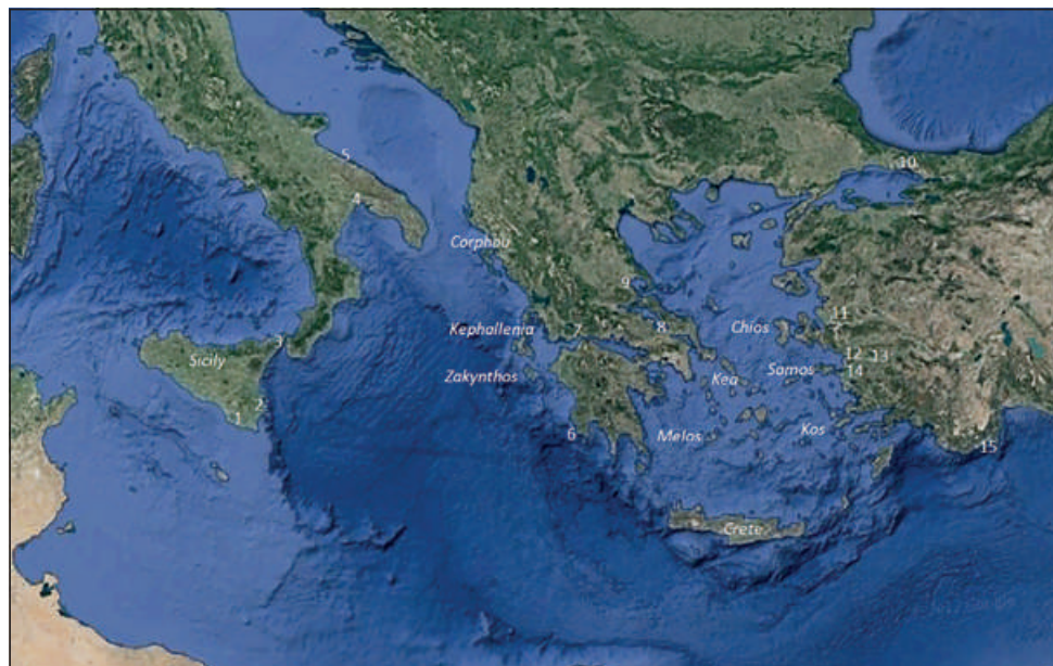
Fig. 6 Byzantine sites, ports and harbours mentioned in the text (apart from those on the Peloponnese): 1 Pachynus (Porto Palo). – 2 Syracuse. – 3 Messina. – 4 Taranto. – 5 Bari. – 6 Methone. – 7 Naupaktos. – 8 Euripos-Chalkis. – 9 Demetrias. – 10 Constantinople. – 11 Smyrna. – 12 Ephesos. – 13 Theologos. – 14 Phygela. – 15 Myra.