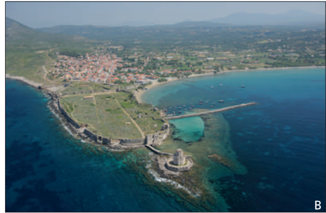
Fig. 1 Methone from the air: A 1953. Two moles to the east of the castle of Methone, a submerged old jetty, parallel to the castle, and another, perpendicular to the castle, built in 1890. – B 2010. – (A photo K. Andrews, Castles 62 fig. 61; B photo by courtesy of Penelope Matsouka).