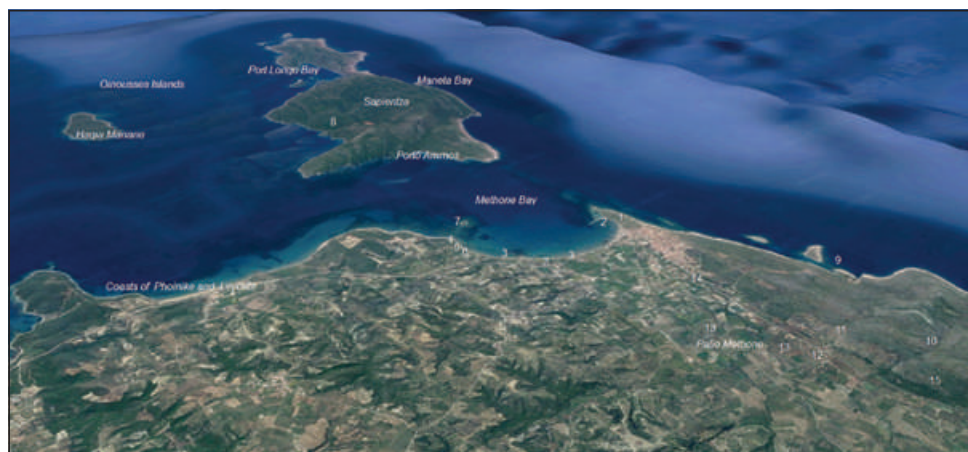
Fig. 3 Satellite image depicting the geomorphology in the area of the Gulf of Methone in the Peloponnese (Greece): 1 Methone. – 2 Harbour. – 3 littoral of the bay (Roman wall, kiln and sherds). – 4 eroding cliff (mosaics, sherds, Byzantine ruins). – 5 Palioi/Ailiades. – 6 Roso Choma/Kokkinia. – 7 Nisakouli/Kouloura. – 8 Sapienza. – 9 Limni Papa (Beacon). – 10 Mount St. Nicholas. – 11 St. Onouphrios. – 12 Agaki (St. Basileios Middle Byzantine church). – 13 Palio Methone. – 14 Early Byzantine basilica. – 15 Lykotomaro. – (Background courtesy of Google Earth).

stone). This cemetery is believed to be a link in the chain of catacombs on that sea route connecting the east to the west, from the island of Melos to Sicily, and it has many features in common with the corresponding cemeteries 7 . In addition, Byzantine churches, tombs, and cisterns lie to the east of Mount St. Nicholas and to the north of Methone, at the sites known as Lykotomaro and Agaki, while remains of settlements can be found all along the coast to the east of the Castle to Kokkinia and Palioi Ailiades 8 (fig. 3). Consequently, Methone, built in a particularly strategic position in the central Mediterranean, on the passage linking the east to the west, took advantage of its position with a port and a castle, an obvious and well-known function that I believe will become clear below when reviewing the evidence provided by the sources. I think that schematically we can speak of four distinct periods in the history of the Byzantine port and naval base of Methone, with similar as well as very different features according to the age: