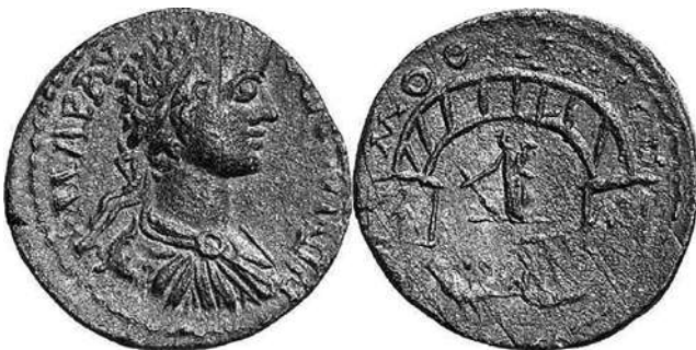
Fig. 2 Methone with its port on an assarion c. AD 198-205 minted under Caracalla. – (From Imhoof-Blumer/Gardner, Numismatic Commentary on Pausanias 68 no 1. Price/Trell, Coins and their Cities 208, fig. 484).

having pinpointed the problem, tried to solve it by constructing a semi-circular mole 5 .