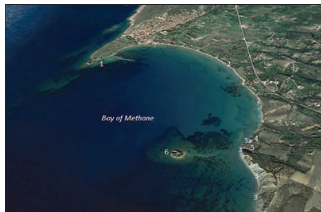
Fig. 7 Satellite image depicting the geomorphology of the bay of Methone, between the island of Nisakouli/Kouloura and the coast of Kokkinia: 1 port of Methone. – 2 littoral of the bay (Roman wall, kiln and sherds). – 3 eroding sea cliff ( 3a Late Roman houses, mosaics, sherds, Byzantine ruins). – 4 Hagios Ilias/Palioi Ailiades. – 5 Rosso Choma/Kokkinia. – 6 Nisakouli/Kouloura. – (Background courtesy of Google Earth).

in the port, but somewhere on the shore of the bay or on the beach near Methone. Probably in Leo's case, limēn means anchorage and refers to part of the bay of Methone, to the east of the castle and the town, and between the island of Nisakouli/Kouloura and the coast of Kokkinia.