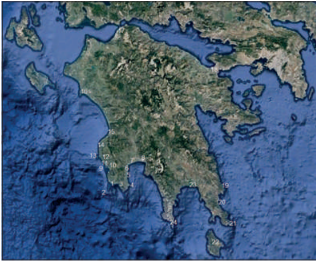
Fig. 5 Byzantine ports, coastal sites and settlements in the Peloponnese (Greece) mentioned in the text: 1 Methone. – 2 Oinousses Islands (Sapienza, Schisa etc). – 3 Phoinikous. – 4 Korone-Asine. – 5 Korone-Petalidi. – 6 Nichoria. – 7 Five Rivers. – 8 Kalamata. – 9 Bay of Pylos. – 10 Koryphasion-Pylos. – 11 Romanou. – 12 Dialiskari. – 13 Island of Prote. – 14 Coast of Philiatra. – 15 Kyparissia-Arkadia. – 16 Pondikou. – 17 Patras. – 18 Corinth. – 19 Hierax (Gerakas). – 20 Monemvasia. – 21 Maleas. – 22 Kythera. – 23 Skala (Elos/Laconia). – 24 Tainaron. – (Background courtesy of Google Earth).

in a state of neglect, remained without doubt a compulsory transit route for sailors and travellers whom we know to have been travelling from other points on the southern Peloponnesian coast. Since the 7 th century, Late Roman coastal installations with natural harbours around the Gulf of Pylos and the region of Five Rivers at Nichoria in the North West Messenian bay, into which navigable rivers flowed, experienced a decline. So, after a period of thriving Late Roman facilities, with many villae and pottery indicating links with the entire Mediterranean, we see coastal settlements with some kind of anchorages being abandoned, with the population withdrawing into the hinterland and settling in fortified places 29 . Although the role of environmental changes due to alluvial processes (Coryphasion-Pylos, Five Rivers) cannot be overlooked, human geography and action are crucial in these changes. The case of the abandonment of the unfortified seaport of Korone-Petalidi (with an ancient harbour and a not very strong acropolis) is typical; from the 7 th century onwards, according to the archaeological data so far, there is no evidence of any activity at the site until the 10 th century. The population of the area most likely sought refuge further south in the very old fortified and safer town of Asine, which was renamed Korone and also had a harbour 30 . This indicates the inhabitants' new more conservative, cautious, defensive