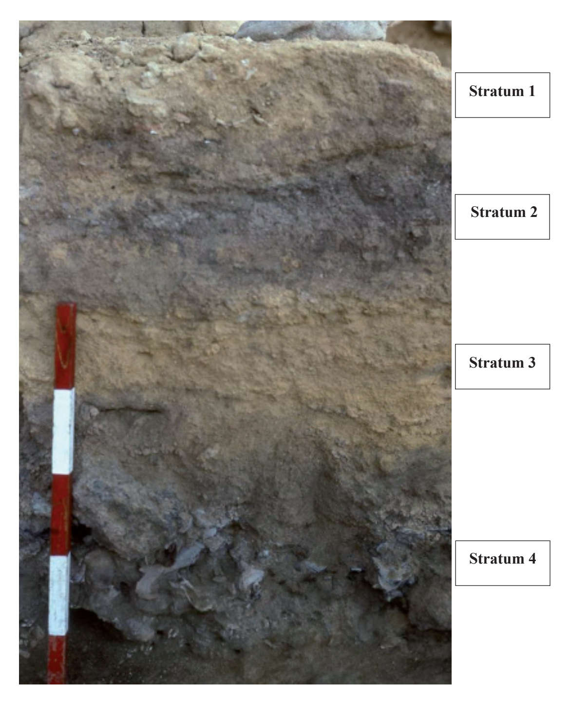
Fig. 4. Photo of the major stratigraphic sequence at Aetokremnos