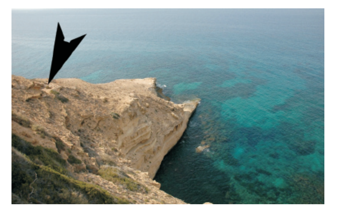
Fig. 2. Photo of the location on Aetokremnos