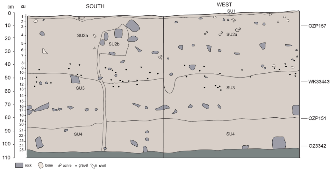
Figure 2 Stratigraphic drawing of Square B.