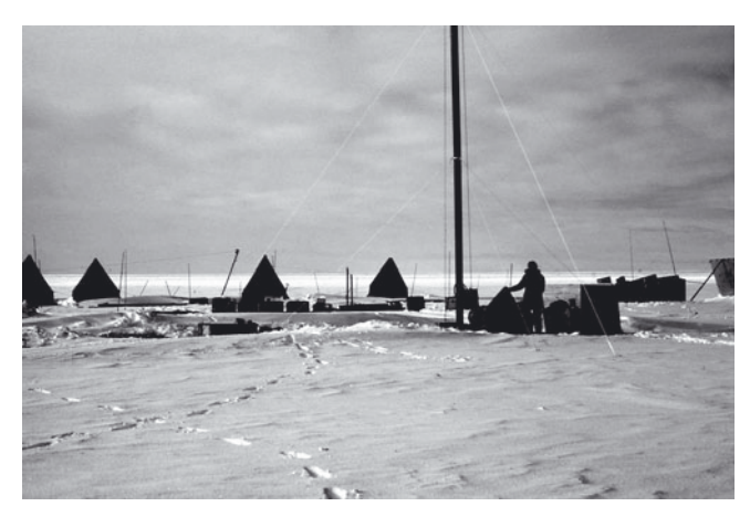
Fig. 2. Drill camp at site A, Greenland, 1985. The cold central regions of Greenland are ideal for borehole thermometry and other techniques of ice-core paleoclimatology. Site A was studied by European and US teams as part of the site-selection activities for GRIP and GISP2.